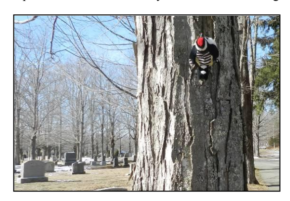
Yellow-bellied Sapsucker in the Rye cemetery.