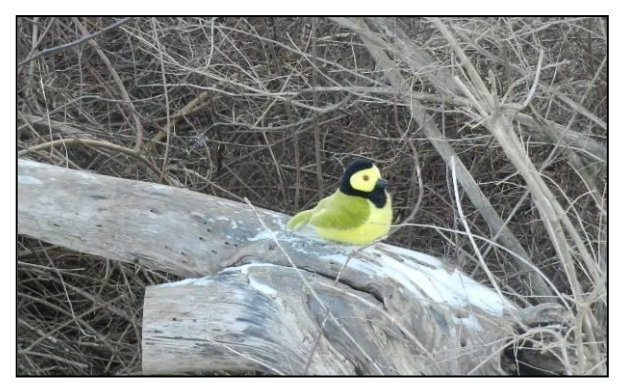
Hooded Warbler at Odiorne (don't we wish!).